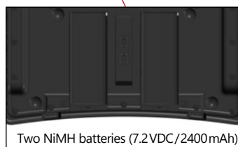
Two NiMH batteries (7.2VDC/2400mAh)