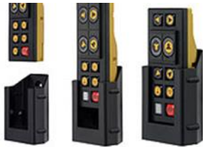
Wall mount base unit charging cradle