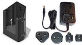
Planar charger 110-230 VAC