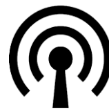
LBT frequency search