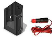
Planar Charger 12-24 VDC