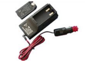
750 mAh / 3.6 V 12-24 VDC battery charger kit